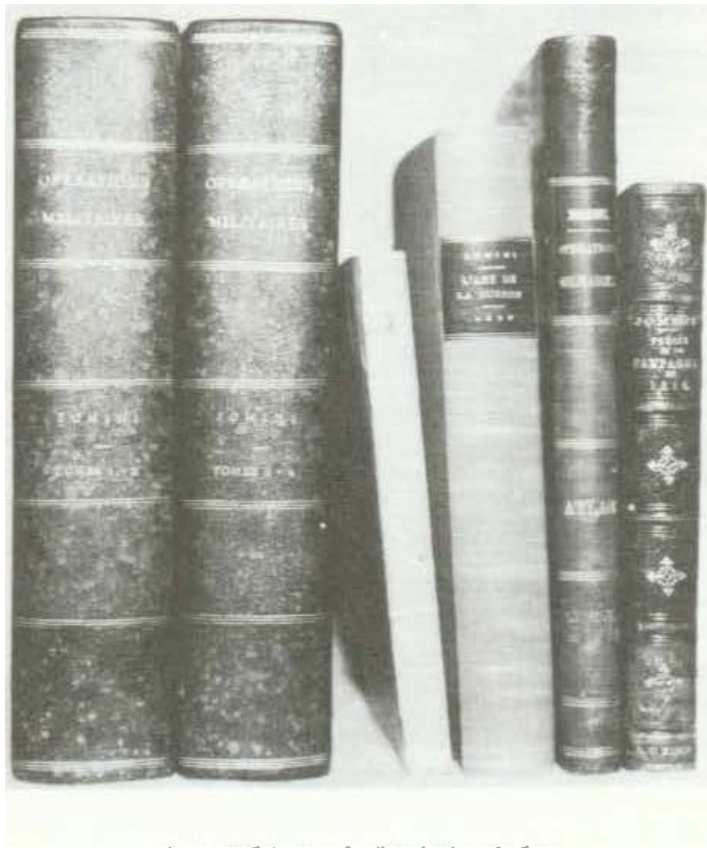
A sampling of Jomini titles.